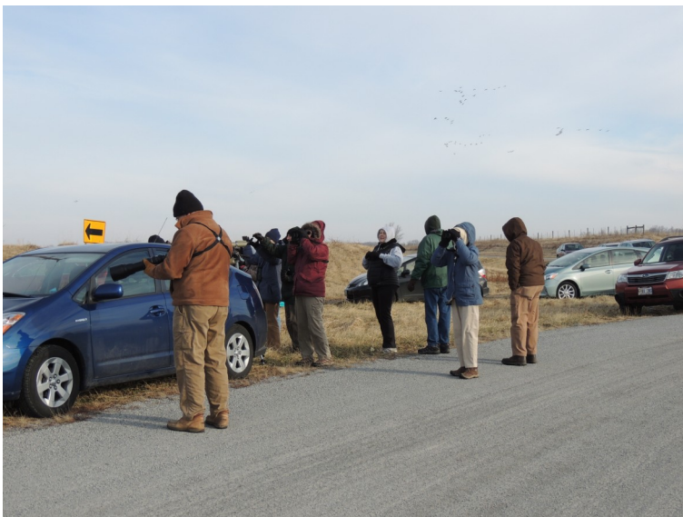
Photos from Highland Stone Gravel Pits field trip. Bird Club field trip participants looking at flocks of geese. Bald Eagle by nest. Flocks of geese in a field by the Highland Stone Gravel Pits.

Turkey Vulture, Red-shouldered Hawk, Great Blue Heron, Horned Lark