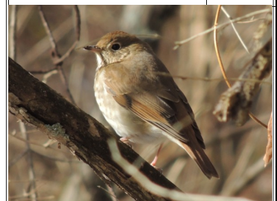
Hermit Thrush. East Fork SP