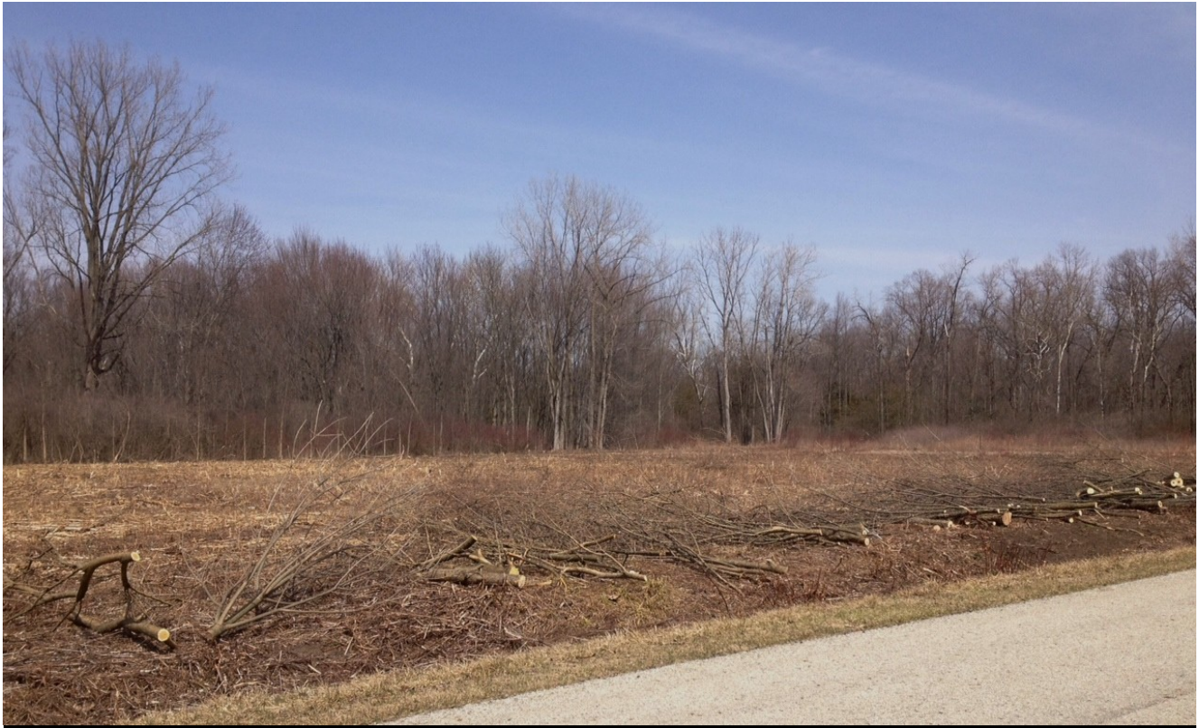
Brush cut and piled by the road at Cedar Bog.